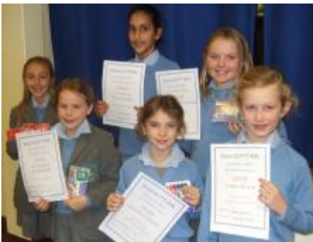
Dunottar Art Competition winners with their certificates.

Once again Bramley took part in the annual Dunottar School Junior Art Exhibition at which a number of girls won prizes. The theme was 'Going for Gold' and the individual winners were as follows: